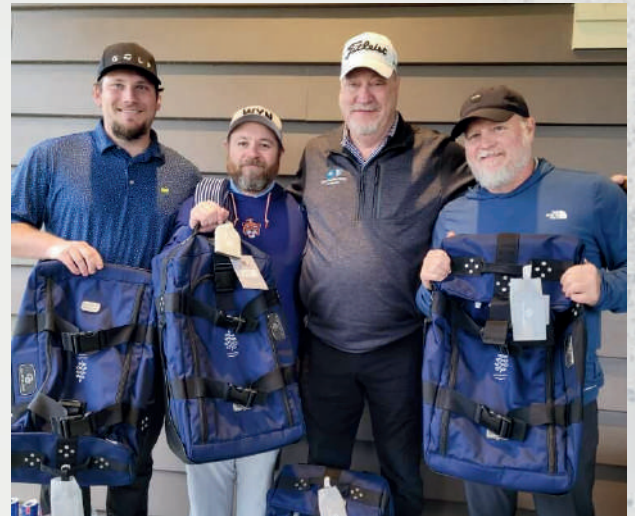
Team Net Winners Blue Cross Blue Shield